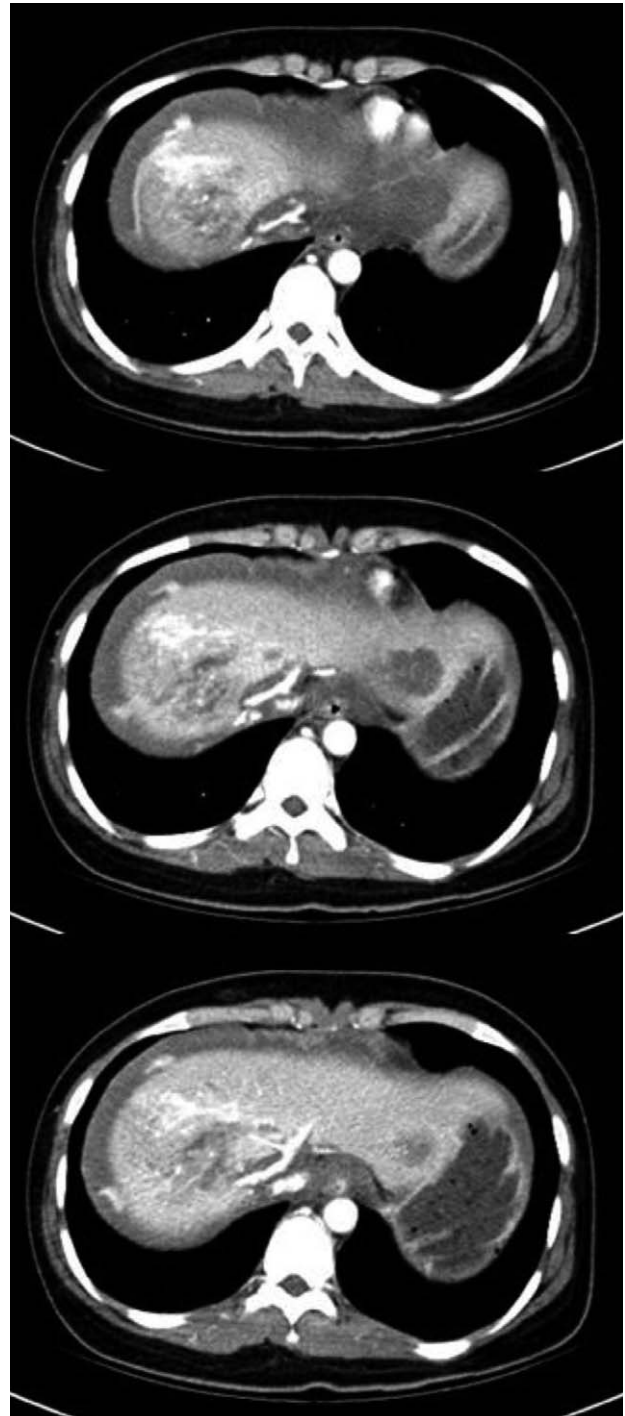
Fig. 1. Three consecutive cuts of Axial CT scan at the level of juxtahepatic IVC demonstrate blunt hepatic injury and thrombus inside the IVC.

Postoperative course was smooth without events, and a 2 nd look operation was decided on postinjury day 4. There was no more noticeable bleeder found after gauze removal, but lateral section of the liver