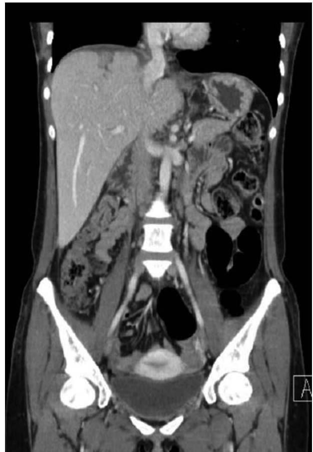
Fig. 5. A coronal view of a follow-up abdominal CT scan on postinjury day 59 demonstrates no more ascites, and the lumen of suprahepatic IVC grew larger compared to the previous CT.