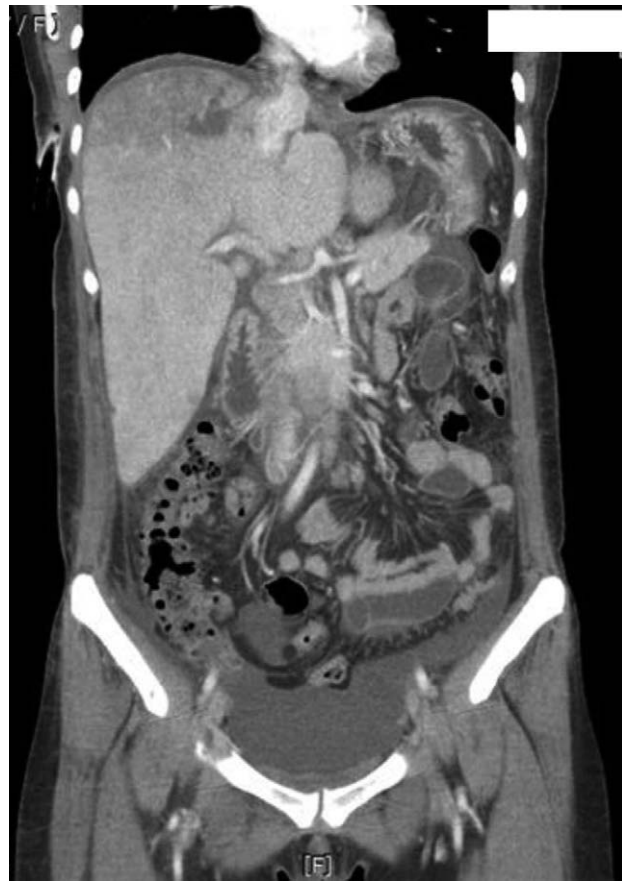
Fig. 3. A large amount of fluid was noticed in the pelvic cavity accompanied with mild periportal edema and narrowing of suprahepatic IVC was noticed at the level of the diaphragm.