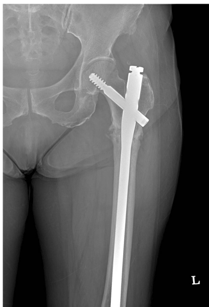
Fig. 5 Union of fracture was obtained 11 months after operation

The mean age of the 76 patients was 71.4 \pm 8.8 years. The majority of patients were females (three males and 73 females). The BMI was 23.2 \pm 3.0 kg/m 2 on average. The bone