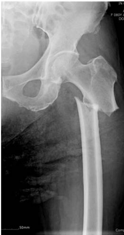
Fig. 2 Pre-operative radiography of an 80-year-old woman who had taken oral alendronate medication for five years prior to atypical femoral subtrochanteric fracture

analyses were carried out using SPSS version 20.0 software package (Chicago, IL, USA). P-values less than 0.05 were considered statistically significant. This study was reviewed and approved by the institutional review board, and informed consent from the patients was waived.