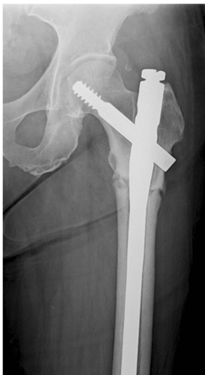
Fig. 4 At six months after operation, delayed union of fracture was noticed. Parathyroid hormone (PTH) was administered subcutaneously for four months