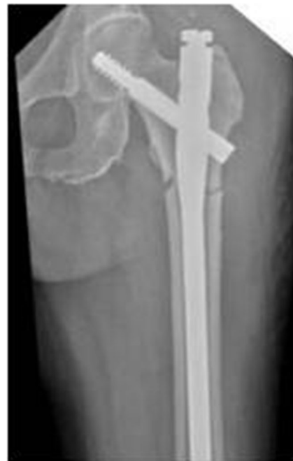
Fig. 3 Immediate postoperative radiography

analyses were carried out using SPSS version 20.0 software package (Chicago, IL, USA). P-values less than 0.05 were considered statistically significant. This study was reviewed and approved by the institutional review board, and informed consent from the patients was waived.