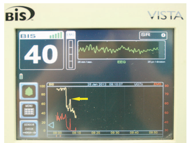
Figure 2. Representative BIS readings in a single patient. Arrow = abrupt increase in the BIS after fasciculation, BIS = bispectral index, EMG = electromyography, red line = EMG values.