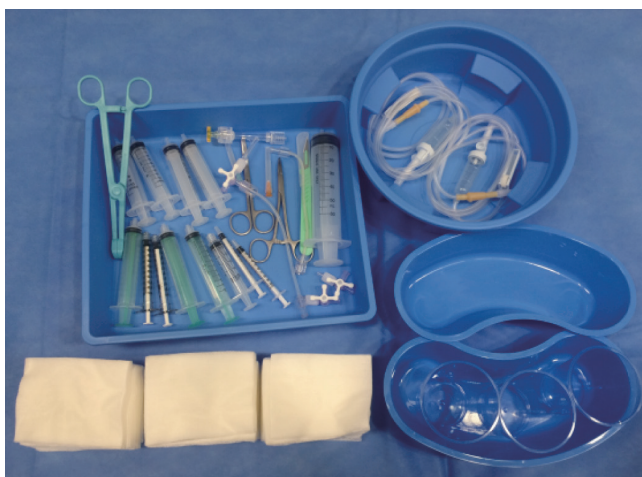
Fig. 2. Customized EVT kit. Kit contains basic equipment for endovascular procedure at discretion of NI physician, such as syringes, trays, sterile gauze, 3-way check valves, and flushing lines, which could be beneficial in reducing time for preparing procedure in off-hours. EVT = endovascular treatment, NI = neurointervention

A customized EVT kit may be beneficial. This kit contains basic items to perform endovascular procedures, such as syringes, trays, sterile gauze, 3-way check valves, and flushing lines (Fig. 2). Considering that all items are usable during normal working hours for other endovascular procedures, a customized kit can be consumed and re-created every day or once a week, according to the expiration date of the equipment. Alternatively, a standardized stroke kit can be created and equipped in the angiography suites. This kit consists of specific devices for performing thrombectomy, such as a guide sheath, guide catheter with or without balloon, 5 Fr angiography catheter and guidewire, rotating hemostatic valves, and aspiration catheters or stent retrievers with compatible microcatheters. A standardized stroke kit, so called BRISK (brisk recanalization ischemic stroke kit), was used in a previous report for time-saving process improvement (40). All NI team members should be well-acquainted with the