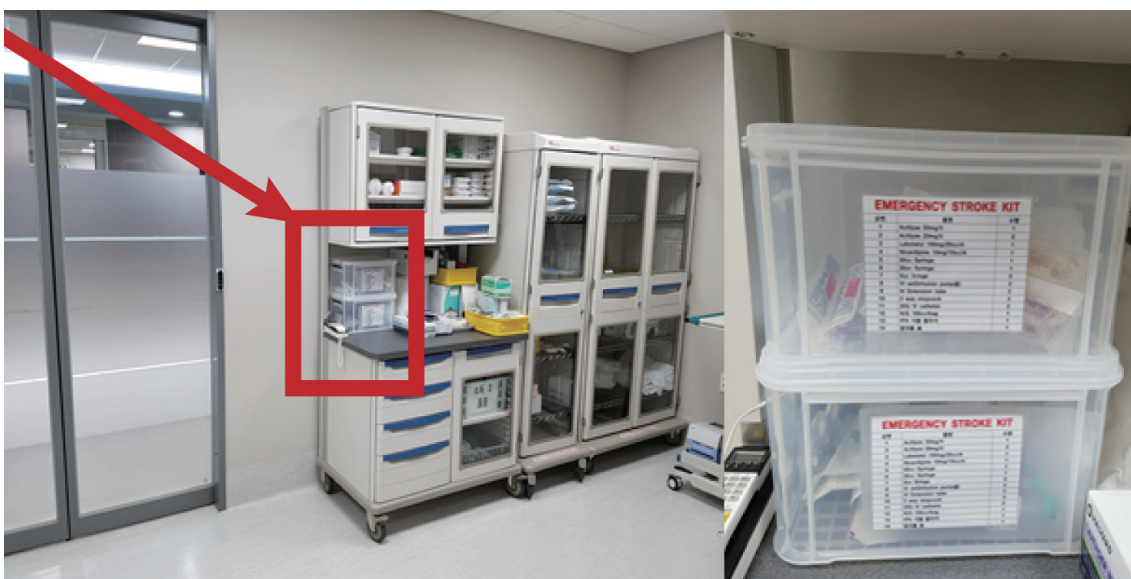
Fig. 1. Customized emergency stroke kit. Kit contains basic equipment for IV tPA administration, such as Actylase, Labetolol, Nicardipine, syringes, IV catheter, normal saline bag, and informed consent. IV tPA = intravenous tissue plasminogen activator

Within the past year, secondary analyses of clinical trials have established that achieving a reduced imaging-to-reperfusion time significantly improved the chance of achieving a functionally independent outcome (33-35). The Endovascular Treatment for Small Core and Proximal