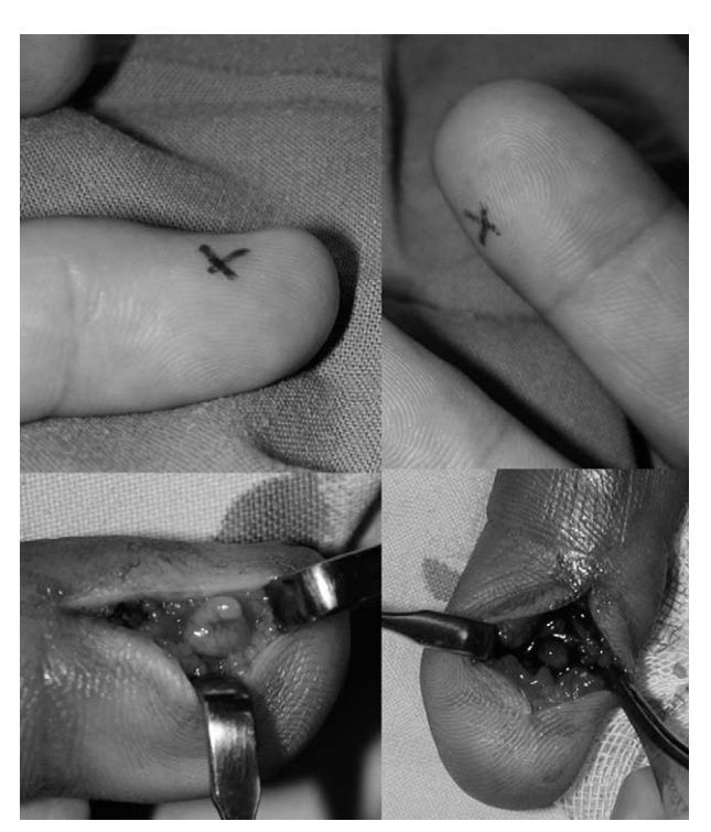
Fig 3: Double Pulp tumors on both hands in one patient. Both the tumors were excised at the same time.

All the patients had electrical shock-like pain (elicited by touch). Cold hypersensitivity was elicited in 71.7% of the subungual tumors and 61.5% of the pulp tumors. Paroxysmal radiating pain and blue discoloration were found less frequently, but a palpable neuropathic nodule was